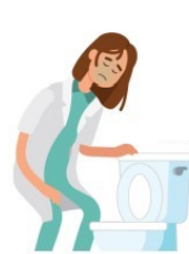
Severe nausea and throwing up (not like morning sickness)