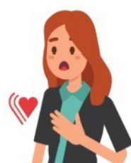
Chest pain or fast-beating heart