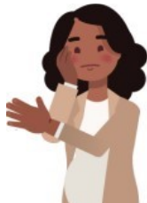
Extreme swelling of your hands or face