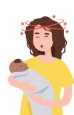
Dizziness or fainting