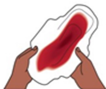
Heavy vaginal bleeding (more than your period) after you give birth

When you reach the office or your OB Provider, tell them: