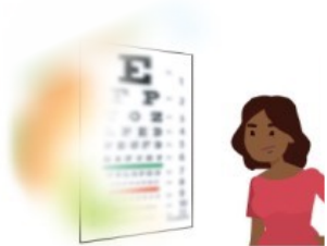
Changes in your vision